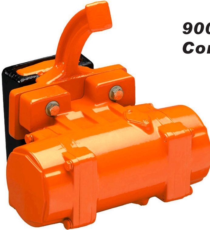
U1-1600 shown with optional male and female brackets

The Martin® U-Series High Frequency Concrete Form Vibrators solve problems common in the precast industry. These high-frequency electric vibrators will improve material consolidation for exceptional strength and finish.