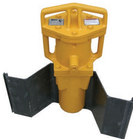
Bolt-on adapters sold separately.

A Tradition of Quality and Service Since 1975