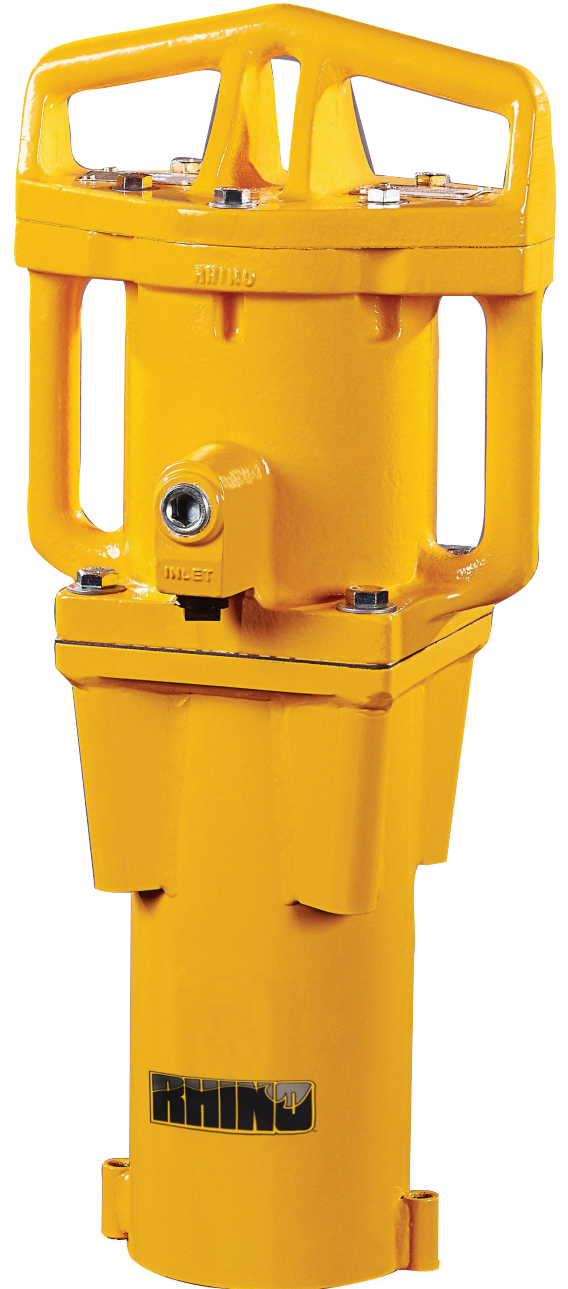
Bolt-on adapters sold separately.