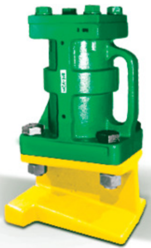
AVAILABLE: PN: 34-10010 ROLL-A-VIBE w/ Carrier Head f/ Piston Vibrators

Easily roll the Vibrator to the Car and place it into the Hopper Car Pocket Bracket. When the Car is empty, easily lift the Vibrator out of the Pocket and store the unit for next use.