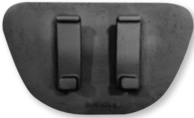
LG SA FEMALE WEDGE BRACKET PN: 32-17330

WORKMASTER's WEDGE MOUNT CRADLE LUG BRACKET is the highest quality mount available. The Bracket's heavy-duty, cast steel construction, and the Easy Grip, Bolt-On Side Handle makes it long lasting, faster, and easier to move the Vibrator Assembly from Pocket-to-Pocket.