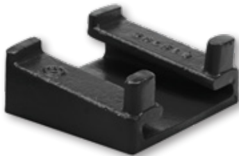
FEMALE WEDGE BRACKET PN: 32-17327

WORKMASTER's Weld-On HOPPER CAR POCKET BRACKETS provides an easily installed mounting pocket that transmits maximum vibration from the vibrator to the railcar. Always keep a pair of either of these cast iron brackets at your unloading site and you'll never be slowed by missing or damaged brackets again!