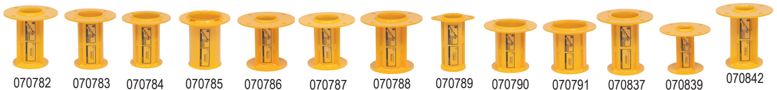
Chart 1 - Master chuck and chuck adapter sizes and part numbers.