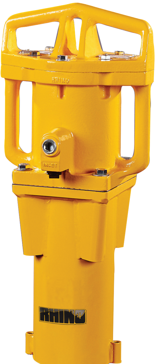
Bolt-on adapters sold separately.